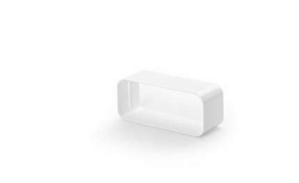
White connector - rectangular section 9700 533