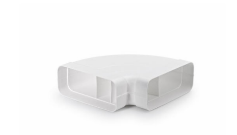
White Horizontal 90° Corner connector - rectangular section 9700 534