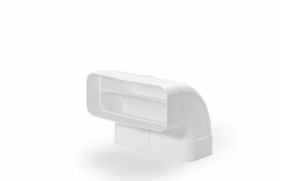
White Vertical 90° Corner connector - rectangular section 9700 535