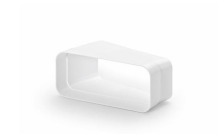
Horizontal 15° Corner connector - rectangular section 9700 536