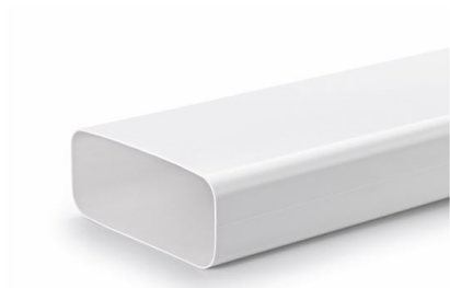
White tube - rectangular section 9700 532